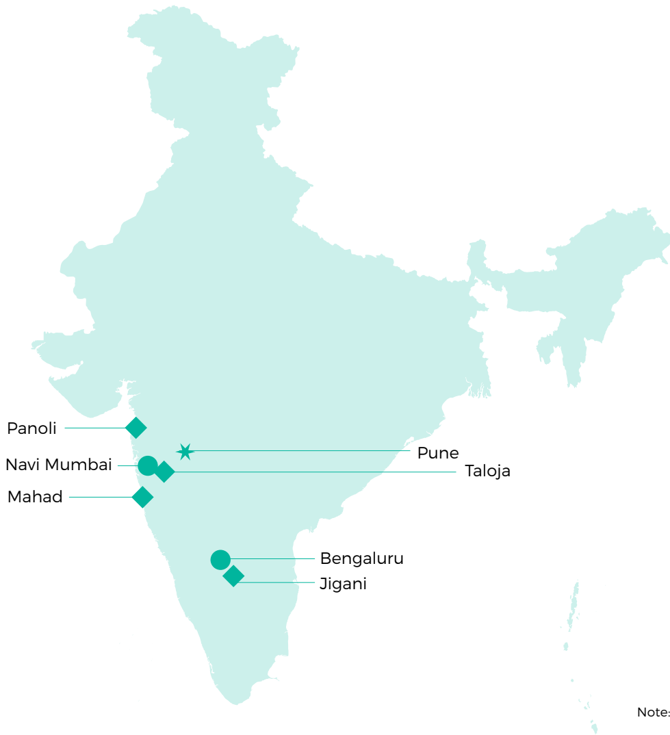
Note: Map not to scale.

Our five manufacturing facilities span across three strategic locations in India: Gujarat, Maharashtra and Karnataka.